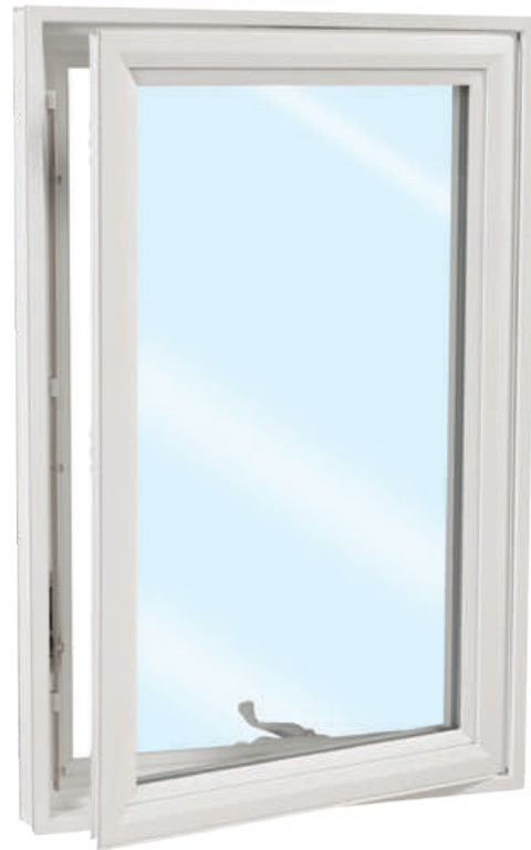
Series 755 Casement