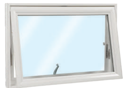
Series 705 Awning